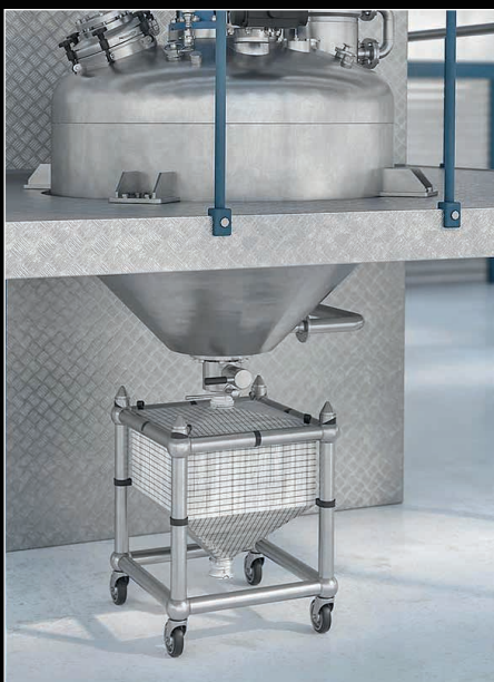
Emptying out of vacuum dryer via APORT into ACUBE packaging unit

A PORT is the worldwide first and the only valve which meets all these requirements.