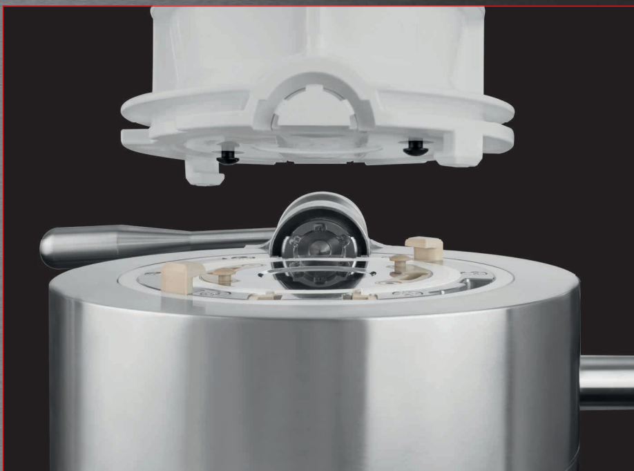
Starting situation of charging process