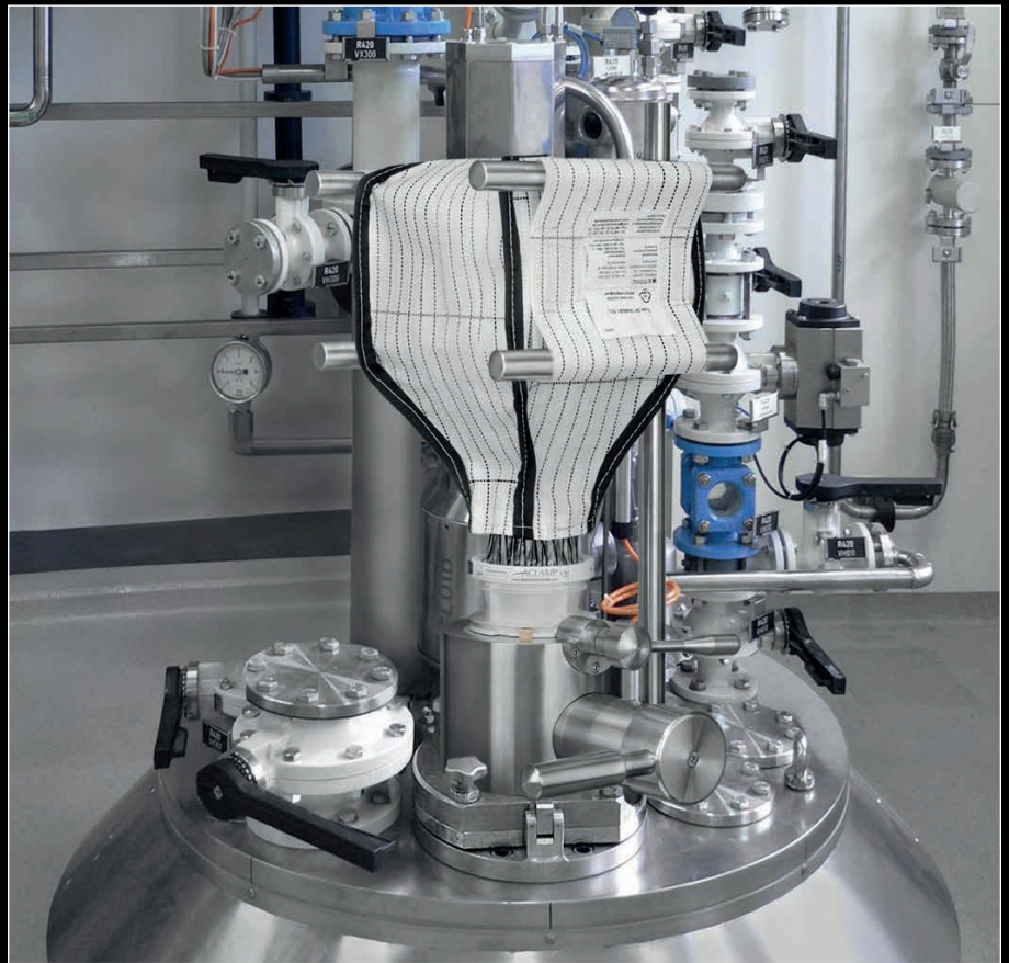
Single-use reactor charging with vacuum & pressure resistant APORT

The APORT is used in applications that include process vessels with explosive atmospheres such as reactors, blenders and dryers with high demands for containment, vacuum and pressure shock resistance.