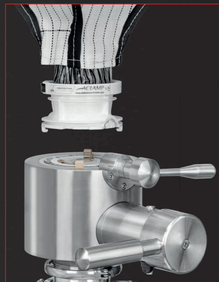
Hybrid connection or disconnection: AVAX single-use on top and APORT with integrated AVAX stainless steel

Currently, complex and difficult to clean systems are being installed for pressure, vacuum, temperature, CIP/SIP and solvent resistance applications.