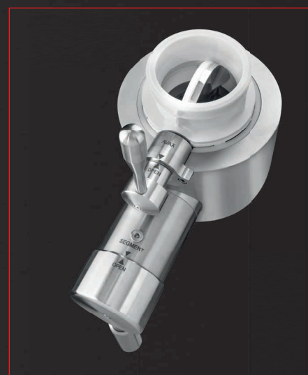
APORT locked and open